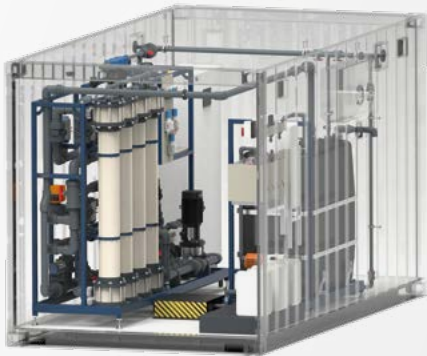
Direct nanofiltration with hollow fiber membranes (DNF)

and national standards in terms of its parameters, including quality and composition.