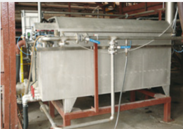
SYNTHOS Kralupy, Czech Republic, 4FBO_atyp