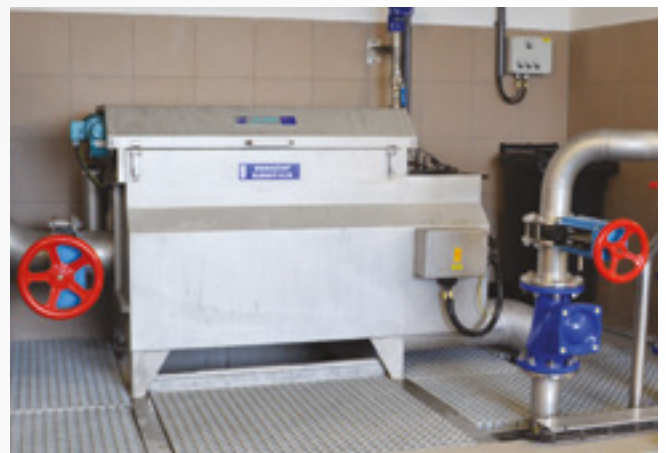
WWTP Chromeč, Czech Republic, 2FBO