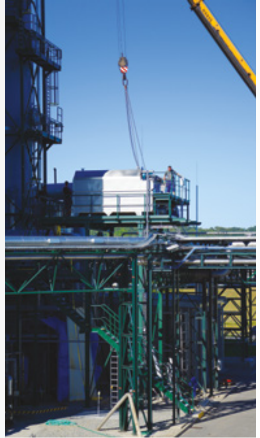
TTD Tereos Dobrovice, Czech Republic, 6FBO_atyp