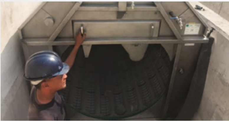
TBL Mwanza, Tanzania, 6FBB