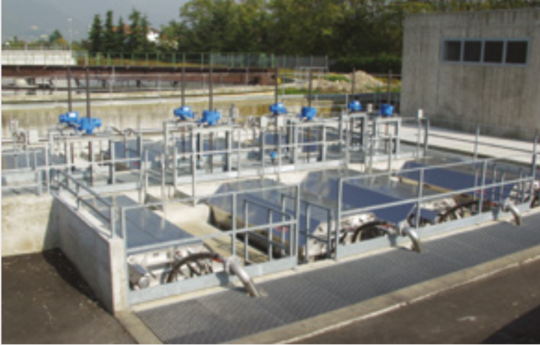
WWTP Ranica, Italy, 6FBB